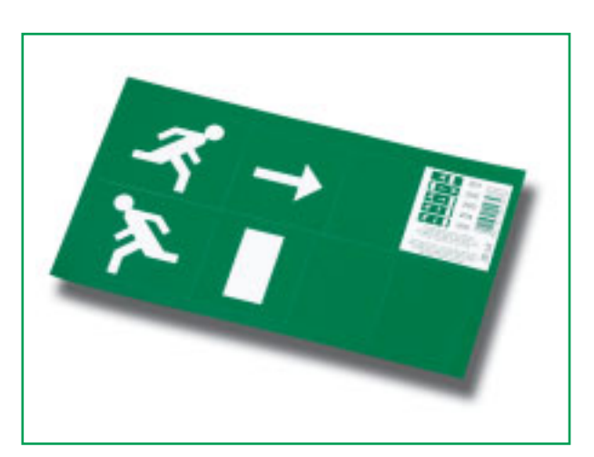
Zeta II legend kit